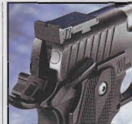
Perfect 10's slide features cocking serrations fore and aft, while the rear sight is adjustable to help optimize the 10mm's performance potential.

To facilitate the fastest possible reload, STI incorporated an aluminum magazine