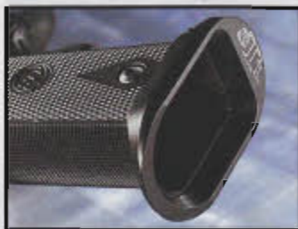
The Perfect 10's cavernous magazine well makes reloading incredibly easy with the pistol's high-capacity, double-stack magazines.

Predictably, hot-rodding any weapon system platform beyond what it was originally designed for accelerates wear and shortens service life. This is true of a 10mm built on a standard 1911 frame designed for the mild mannered .45 ACP, as well as .40 S&W pistols on 9mm frames. I'm convinced, however, that the modular 2011 STI frame can stand up to a high volume of 10mm ammunition without a problem.