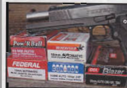
Once broken in, the Perfect 10 handled a variety of 10mm loads without missing a beat.

The long slide and mounted light required a special holster and I was able to reconfigure my BlackHawk Omega tactical thigh holster for the Perfect 10. Considering its intended mission, this style of holster would be the top choice for this heavy-duty pistol.