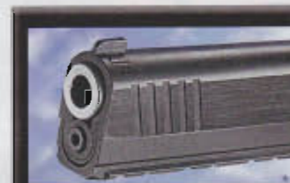
The Perfect 10 sports an accessory rail and a bull-profile barrel that mates directly to the slide and a full-length guide rod system.

In building the Perfect 10, STI went with their innovative modular frame. The upper sub-frame is crafted from steel while the