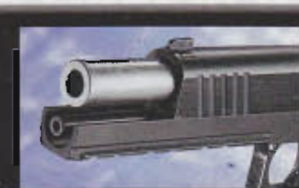
Note the Perfect 10's 6-inch ramped bull barrel is fully supported—an asset when handling the formidable 10mm load.

triggerguard and grip frame are made of high impact, weight saving polymer. The hybrid frame allows STI to build a high capacity extended slide pistol, which only weighs about 3 ounces more than a standard production 1911.