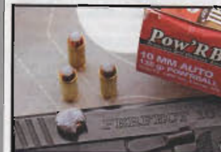
CorBon Pow'RBall averaged 1,428 fps and expanded to over 1.5 times original diameter.