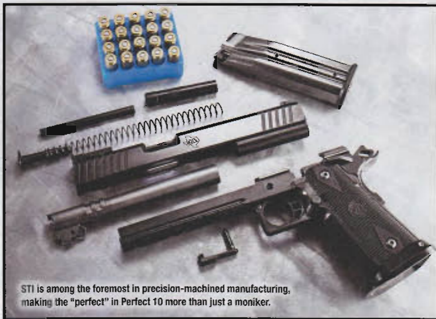
STI is among the foremost in precision-machined manufacturing, making the "perfect" in Perfect 10 more than just a moniker.

Well, I finally got around to getting a sample Perfect 10 to put through the paces and I can report that this bad boy rocks. If a high performance, easy to shoot pistol floats your boat, the Perfect 10 may be the gun for you.