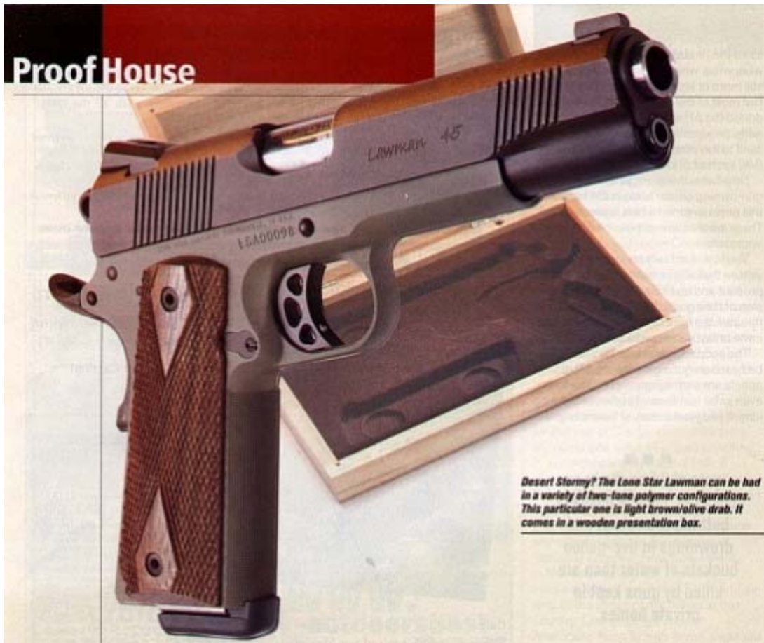
Desert Stormy? The Lone Star Lawman can be had in a variety of two-tone polymer configurations. This particular one is light brown/olive drab. It comes in a wooden presentation box.