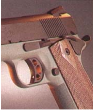
Rosewood grips, match trigger, extended beavertail and Novak sights. What's not to like?

The trigger on my test sample, incidentally, broke at an exceptionally crisp four pounds with minimal take-up. That, combined with the justifiably popular Novak sights, contributed greatly to the results.