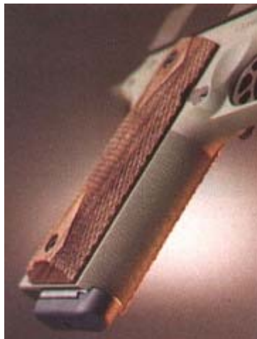
A finely checkered frontstrap provides an excellent nonslip grip. And it looks good.

After setting up targets at 25 yards, I proceeded to shoot a series of five-shot groups with everything I had from a sandbagged rest. Although a Ransom Rest might have given better results, I value my range time too much to deliberately deal myself out of the shooting equation. Even so, I was mightily impressed with the Lone Star Lawman.